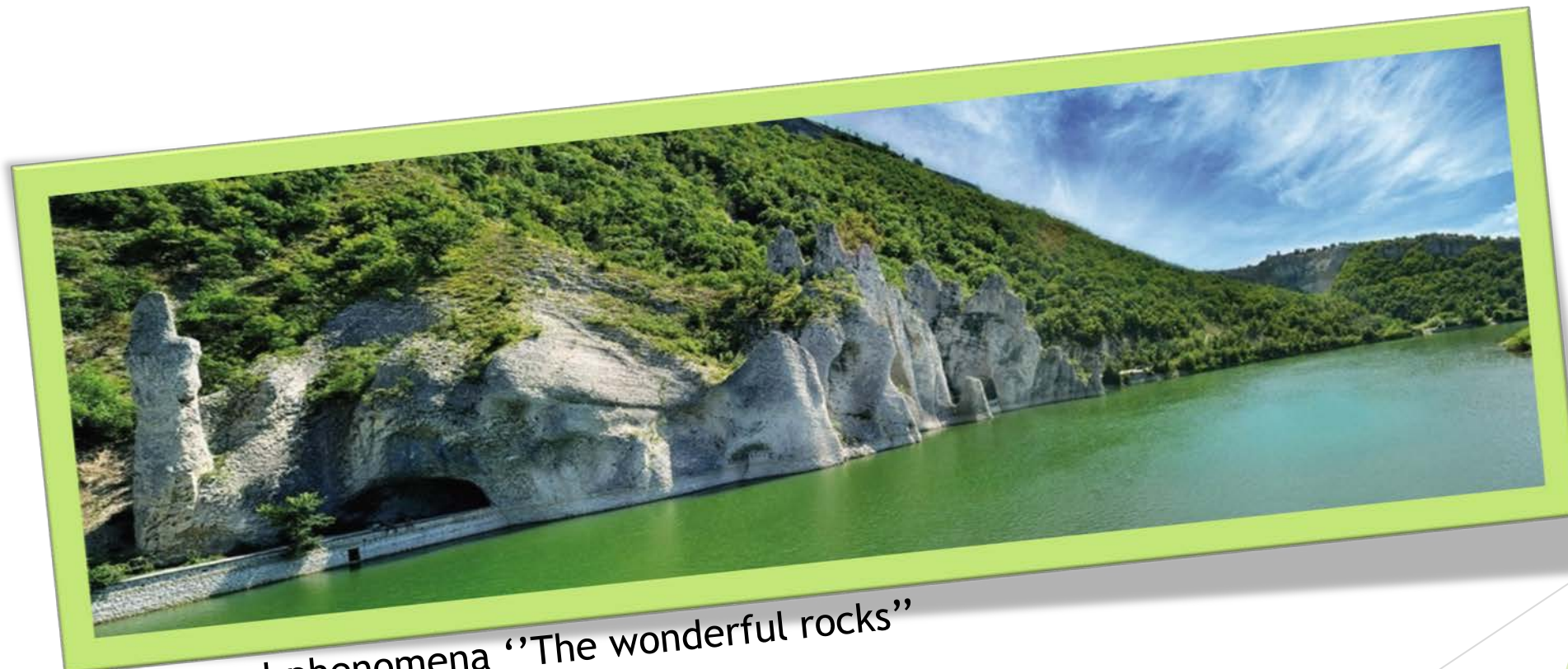
The natural phenomena "The wonderful rocks"