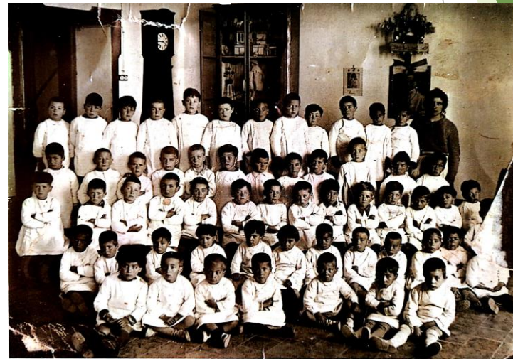
Children in Regina Elena School in the 1933